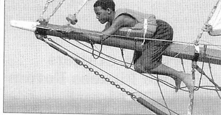
A Camp Wing camper balances precariously on the Aeries , a schooner used by the DBMS as part of its summer Maritime Adventures program.